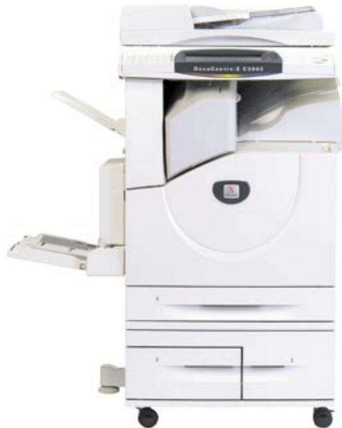
DocuCentre - II C3000 with Tandem Tray module & optional space saving internal A-Finisher