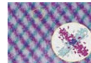
Conventional toner suffers from screen dispersion due to particle size and uneven shape.

The Environmentally friendly EA - HG toner used in Fuji Xerox devices produces finer toner particles, uniform in size and shape to create distinctly smoother, sharper images than conventional toners.