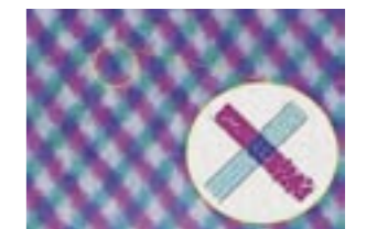
EA - HG Toner's uniform shape & size, reproduces screens precisely without unwanted toner dispersion.