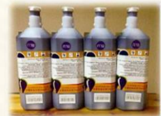
Environment Friendly Specialized Ink ( Blue/Black )